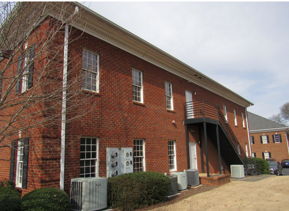
Rear View of Property