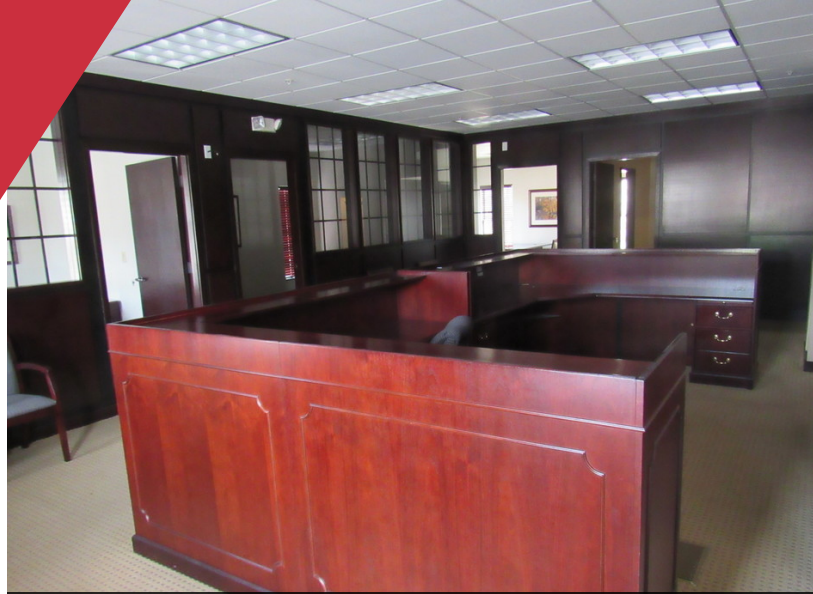
Reception and Office Area