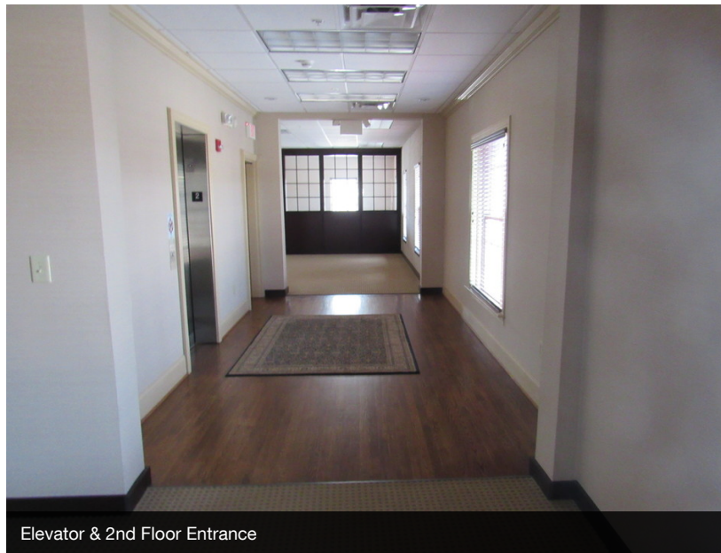
Elevator & 2nd Floor Entrance