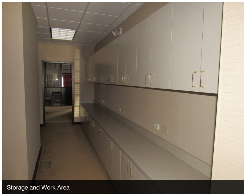
Storage and Work Area