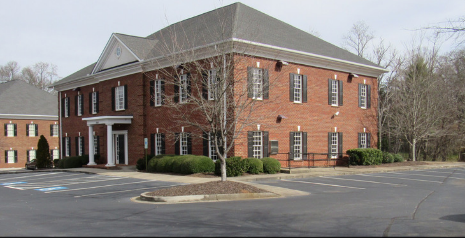
Side View of Property